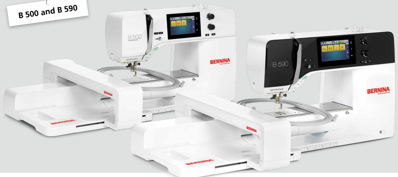
B 500 and B 590

What do wildly-talented cosplayers love about the B 590? Everything. It's faster than their looming deadlines. It's powerful enough for crazy materials. And its embroidery capabilities are absolutely amazing. Cosplayers love this machine and so will you!